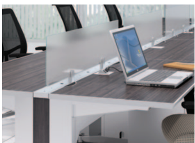
A technology trough routes power and data to worksurface outlets for convenient access.