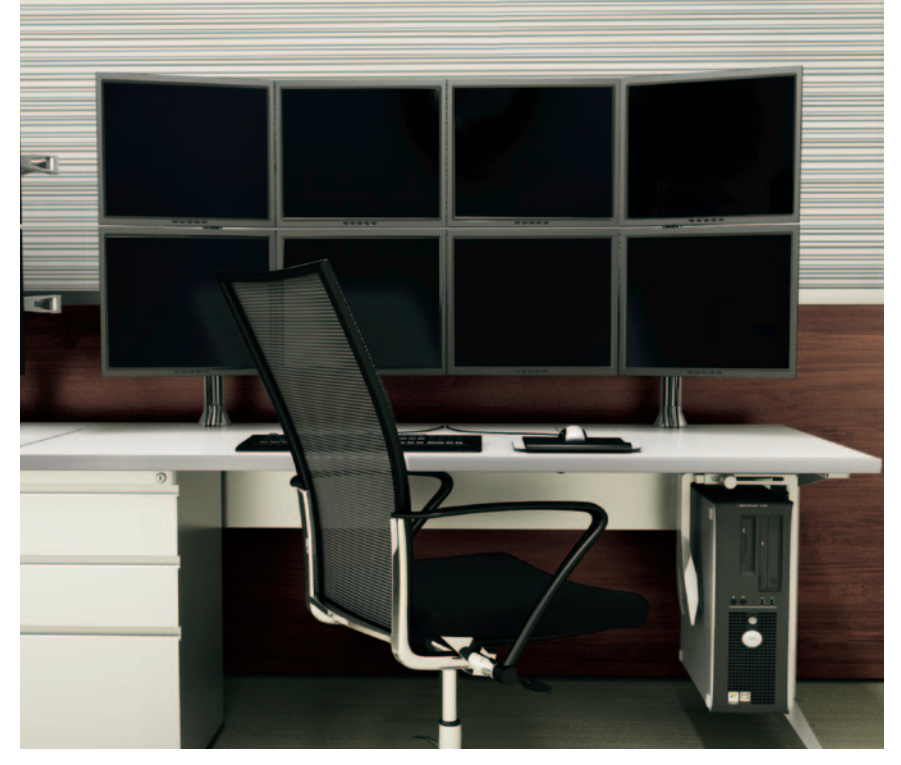
Rugged aluminum posts with articulating arms securely support up to eight flat-screen monitors per user. A CPU Holder can be mounted underneath the desk.