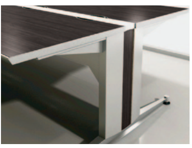
Leg panel inserts match laminate worksurfaces to create a distinctively modern visual motif.