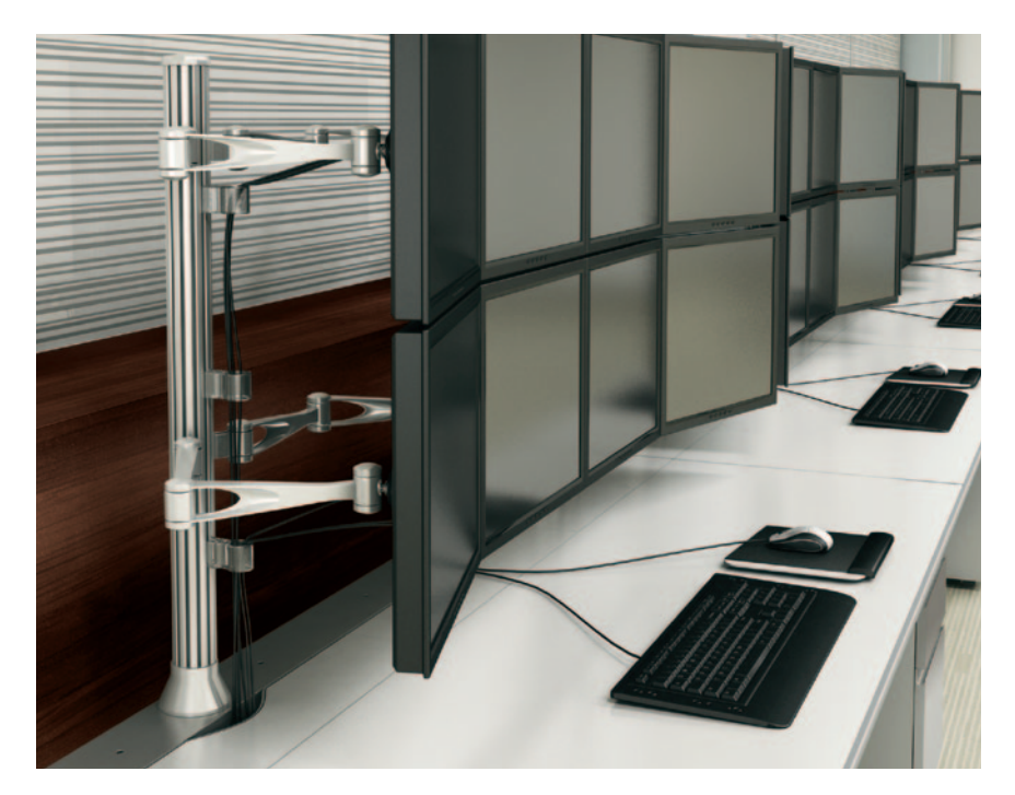
User-friendly arms allow easy adjustment of heights and viewing angles on flat-screen monitors. Keyboard and mouse platforms are also available.