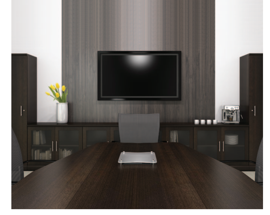
\label{thm:condition} TransAction^{\tiny{\texttt{M}}}\ laminate\ surface\ options\ match\ those\ in\ our\ REAL\ Office^{\tiny{\texttt{M}}}\ casegoods\ collections,\ so\ you\ can\ coordinate\ tables\ with\ a\ wide\ variety\ of\ storage\ and\ presentation\ components.