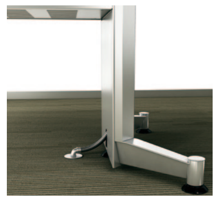
Cords route horizontally through an undersurface trough and vertically within the table leg.