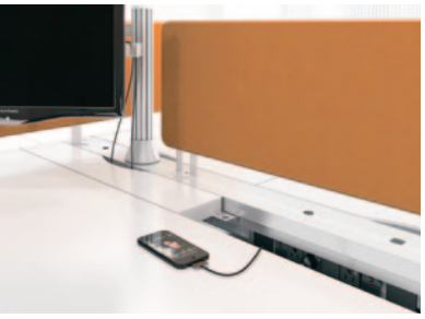
Removable surface panels on both sides of technology trough allow direct access to power/data.