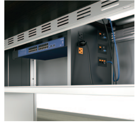
Table troughs can be outfitted with optional rack mount, VGA and custom plate options.