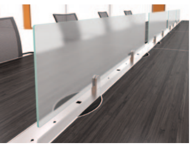
Frosted Acrylic Privacy Screens boast flame-polished edges to give the appearance of glass.