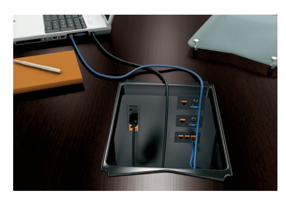
Optional Power/Data Packages install under a floating acrylic cover for easy access to six power outlets and three telecom plates. Additional telecom options and a hardwire infeed are also available.