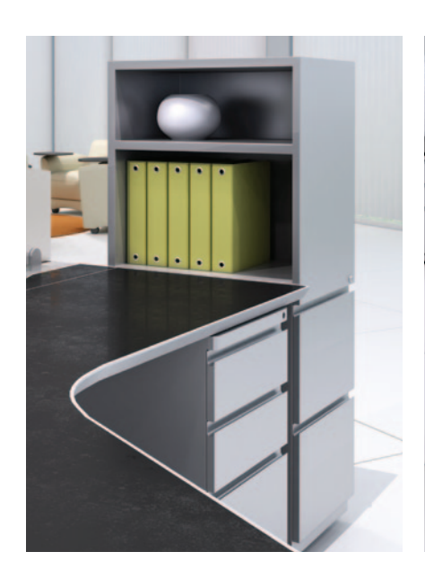
Bookcase Towers incorporate two adjustable shelves and a choice of two pedestal configurations.