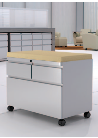
Mobile File Centers with cushions provide lockable storage and serve as casual seating for quick collaborations.