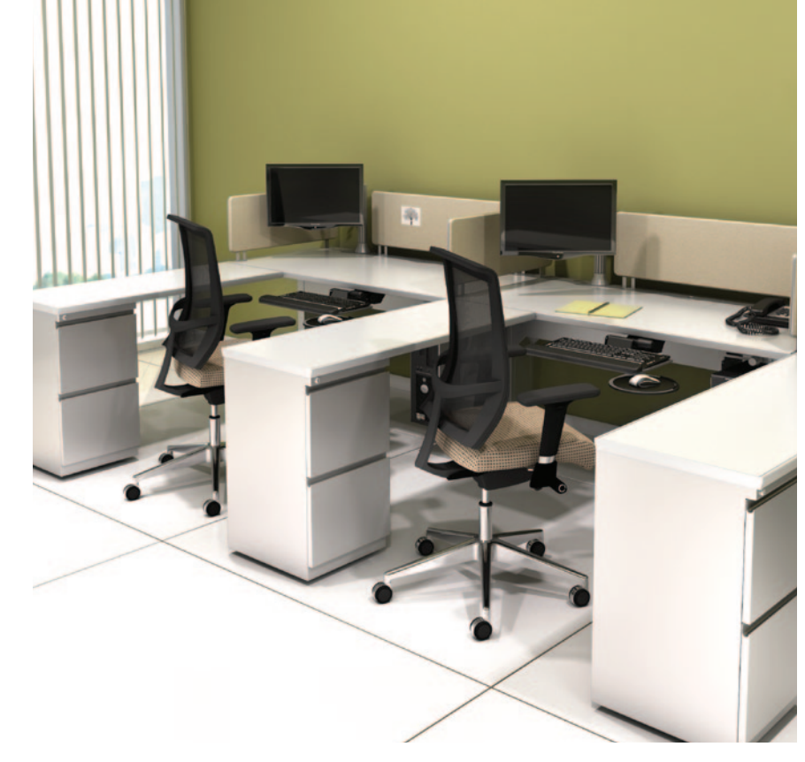
Single-Sided Desks and Returns in Designer White laminate with Pedestals in White finish. Tackboards in Crosstown Ray fabric. Commute™ Chairs in Expo Latte fabric.