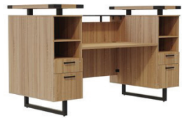
Mirella™ Reception Desk with Glass Countertop