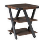
Mirella™ End Table