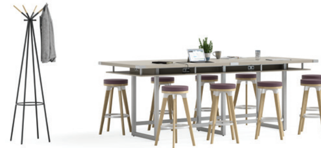
Layout C Mirella 12' Standing-Height Table #MRH12WAH. 9 Resi Bistro Stools #1715. 1 Family Coat Rack #4256BL.