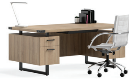
Layout A 1 Mirella Freestanding Desk #MRDFF7236SDD. 1 Flaunt Manager Chair #3456WH. 1 Vamp LED Light #1001SL. 1 Wave Desk Accessory #3221.

Floating worksurfaces and decorative residential-style hardware, combine with essential features, such as integrated power and versatile storage, for a flawless blend of form and function.