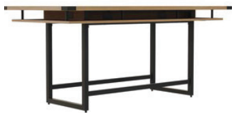
Mirella™ Conference Table, Standing-Height, available 8', 10', 12', 14', 16'