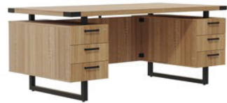
Mirella™ Free Standing Desk, available BF/BF, BBB/BF, BBB/BBB