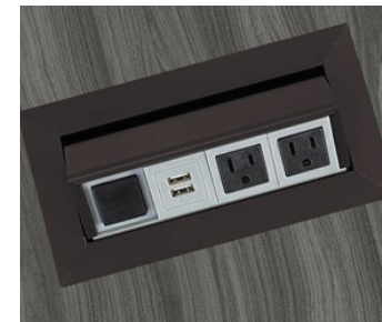
Power Module – 2 Power Outlets, 1 Data Outlet, USB Power