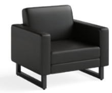
Mirella™ Lounge Chair