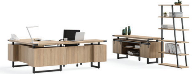
Layout B 1 Mirella L-Shaped Desk #MRLBF6636. 1 Mirella Low Wall Cabinet #MRLWCWDSDD. 1 Mirella 5 Shelf Bookcase #MRBS5SDD. 1 Vamp LED Light #1001SL.