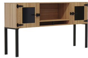
Mirella™ Hutch with Glass Doors, available, 66", 72"