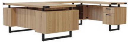
Mirella™ U-Shaped Configuration Desk, available BF/BF, BBB/BF,