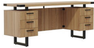
Mirella™ Free Standing Credenza, BF/BF, BBB/BF, BBB/BBB