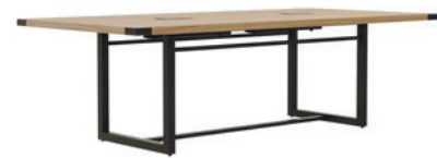
Mirella™ Conference Table, Sitting-Height, available 8', 10', 12', 14', 16'