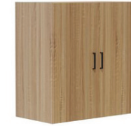
Mirella™ Wood Door Storage Cabinet