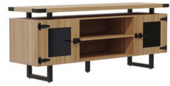
Mirella™ Low Wall Cabinet Glass Doors