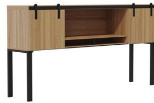
Mirella™ Hutch with Sliding Wood Doors, available, 66", 72"