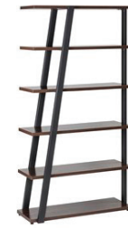
Mirella™ 5 Shelf Bookshelf