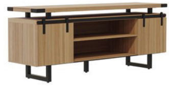
Mirella™ Low Wall Cabinet Wood Doors