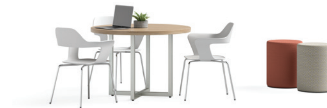
Layout E 1 Mirella 42" Round Table #MR42WAH. 3 Bandi Shell Stacking Chairs #4275WH. 2 Swivel Keg Stools #5050.