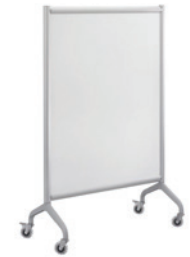
Rumba™ Screen Whiteboard