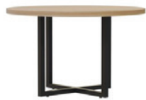
Mirella™ Conference Table, available 42", 48"