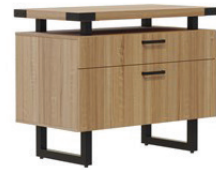
Mirella™ Lateral File