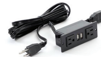
Power Module – Power Module with 2 Power and 2 USB Outlets, 1 Daisy Chain