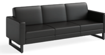
Mirella™ Lounge Sofa