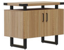
Mirella™ Storage Cabinet