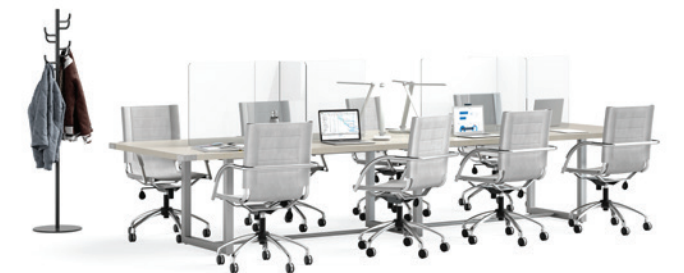
Layout F 1 Mirella 12' Seated-Height Table #MRS12SGY. 8 Flaunt Manager Chairs #3456WH. 2 Privacy Screens #7504CL. 1 Hook Head Coat Rack #4241BL.