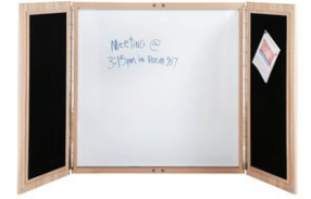
Mirella™ White Board