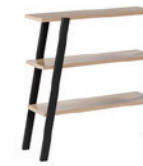
Mirella™ 3 Shelf Bookshelf