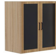
Mirella™ Glass Door Display Cabinet