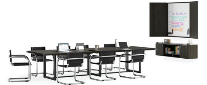
Layout D 1 Mirella 12' Seated-Height Table #MRS12STO. 1 Mirella Whiteboard #MRWBSTO. 1 Mirella Wall-Mounted Hutch #MRHTWD72STO. 8 Flaunt Guest Chairs #3457BL.