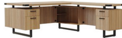
Mirella™ L-Shaped Configuration Desk, available BF/BF, BBB/BF,