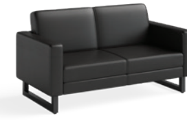
Mirella™ Lounge Settee