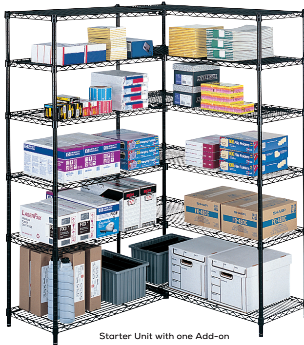
Starter Unit with one Add-on