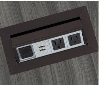
Power Module – 2 Power Outlets, 1 Data Outlet, USB Power