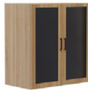
Mirella™ Glass Door Display Cabinet