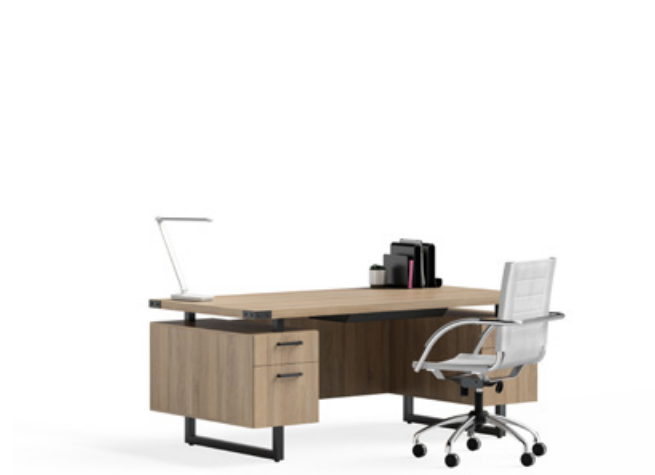
Layout A 1 Mirella Freestanding Desk #MRDFF7236SDD. 1 Flaunt Manager Chair #3456WH. 1 Vamp LED Light #1001SL. 1 Wave Desk Accessory #3221.