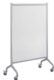
Rumba™ Screen Whiteboard