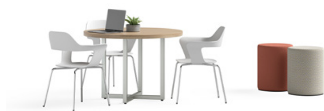
Layout E 1 Mirella 42" Round Table #MR42WAH. 3 Bandi Shell Stacking Chairs #4275WH. 2 Swivel Keg Stools #5050.