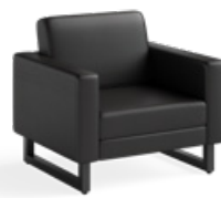
Mirella™ Lounge Chair