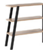
Mirella™ 3 Shelf Bookshelf