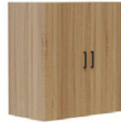
Mirella™ Wood Door Storage Cabinet