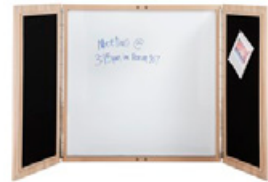
Mirella™ White Board