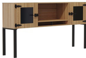
Mirella™ Hutch with Glass Doors, available, 66", 72"