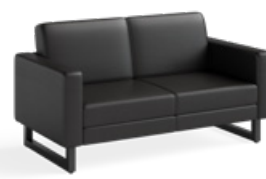
Mirella™ Lounge Settee