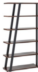
Mirella™ 5 Shelf Bookshelf