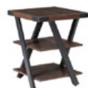
Mirella™ End Table