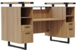
Mirella™ Reception Desk with Glass Countertop