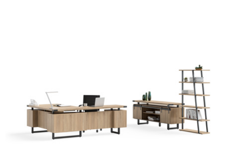
Layout B 1 Mirella L-Shaped Desk #MRLBF6636. 1 Mirella Low Wall Cabinet #MRLWCWDSDD. 1 Mirella 5 Shelf Bookcase #MRBS5SDD. 1 Vamp LED Light #1001SL.