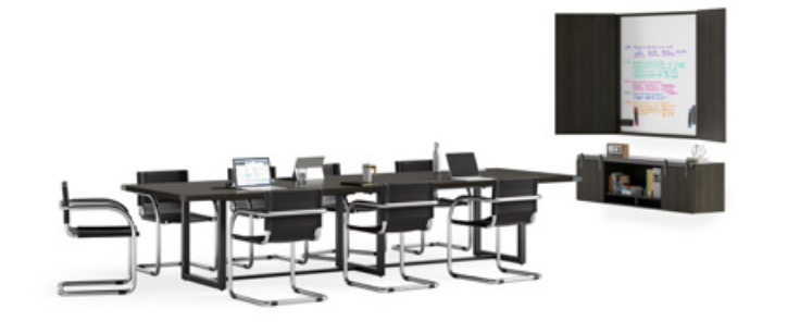
Layout D 1 Mirella 12' Seated-Height Table #MRS12STO. 1 Mirella Whiteboard #MRWBSTO. 1 Mirella Wall-Mounted Hutch #MRHTWD72STO. 8 Flaunt Guest Chairs #3457BL.