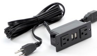
Power Module – Power Module with 2 Power and 2 USB Outlets, 1 Daisy Chain