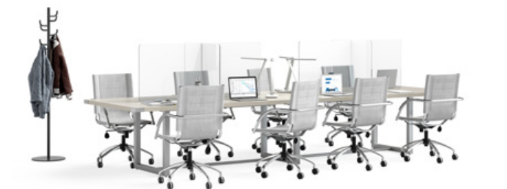
Layout F 1 Mirella 12' Seated-Height Table #MRS12SGY. 8 Flaunt Manager Chairs #3456WH. 2 Privacy Screens #7504CL. 1 Hook Head Coat Rack #4241BL.