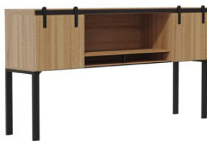
Mirella™ Hutch with Sliding Wood Doors, available, 66", 72"