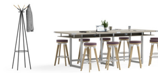
Layout C Mirella 12' Standing-Height Table #MRH12WAH. 9 Resi Bistro Stools #1715. 1 Family Coat Rack #4256BL.