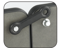
Optional Ganging Connector