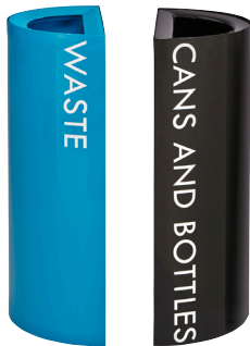
Half-Round Receptacle, Lid and Retainer Ring, 23 Gallon Model #9447 Overall 10 \frac{1}{4} "W x 20 \frac{1}{4} "D x 32 \frac{1}{4} "H